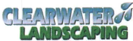
EXHIBIT "C" RES 2372